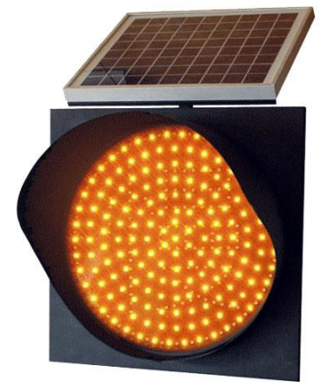
TRAFFIC LED LIGHTS, CONTROLLER & SOLAR LED LIGHT