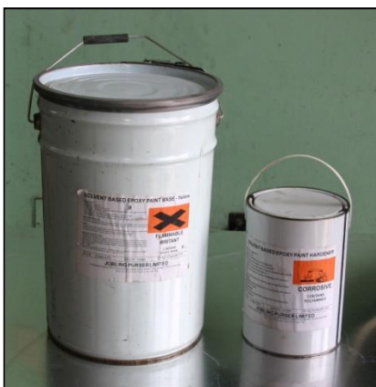
SOLVENT-BASED EPOXY PAINT