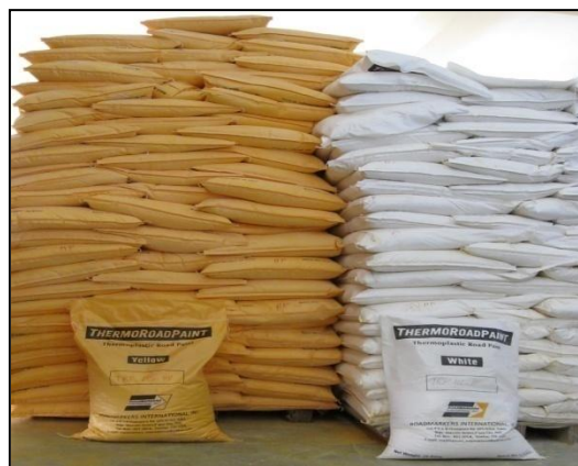
REFLECTORIZED THERMOPLASTIC MATERIALS